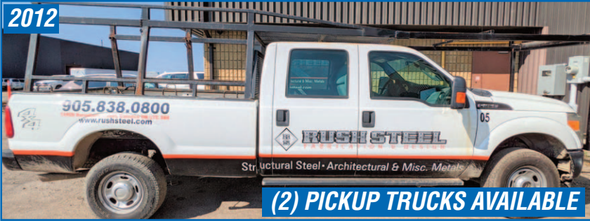
FORD F250 SUPER DUTY XL PICKUP TRUCK