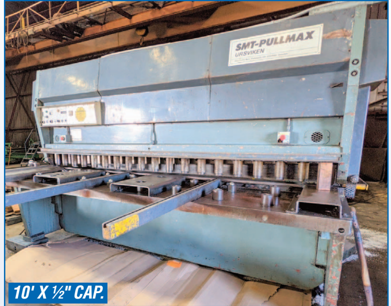
SMT-PULLMAX GST430 HYDRAULIC SHEAR