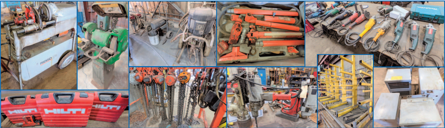
PARTIAL VIEW OF PLANT SUPPORT EQUIPMENT