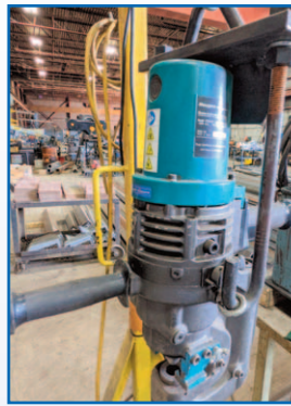
HOUGEN-OGURA PORTABLE ELECTRO-HYDRAULIC HOLE PUNCH