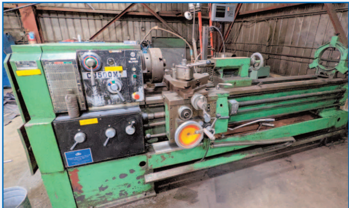
ZMM SILVEN CU500MT LATHE