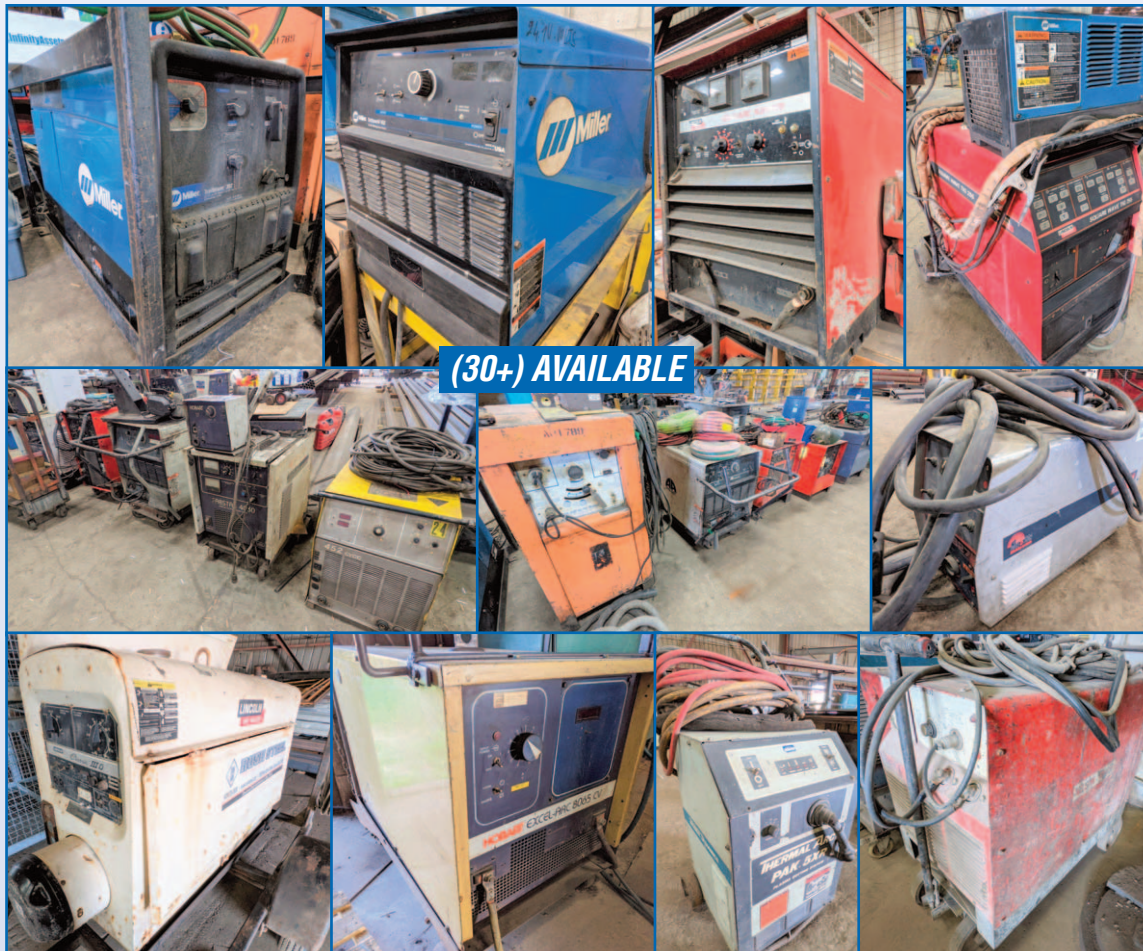
PARTIAL VIEW OF NELSON, LINCOLN ELECTRIC, MILLER, HOBART, ESAB, ALTRA-ARC, CANOX, LINDE, UNITIG, AIRCO, ARCWELD, RED-D-ARC, THERMAL DYNAMIC WELDERS