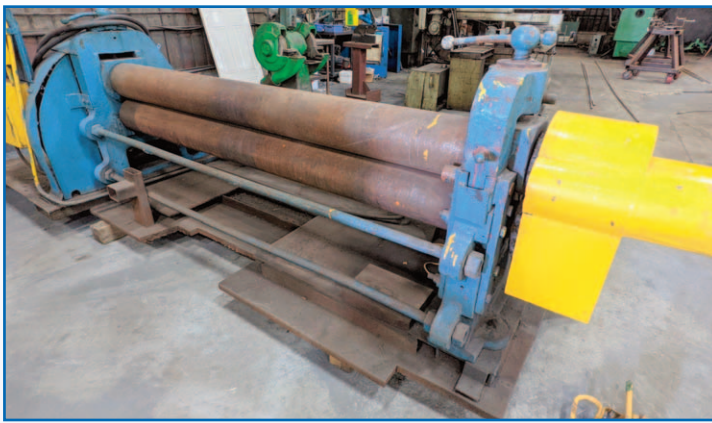
APPROX. 7' X 1/2" CAP. PLATE ROLLS