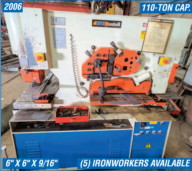
FABMASTER IW-110S, SD HYDRAULIC IRONWORKER

Structural Steel Fabrication Facility 13908 Hurontario St., Inglewood (Brampton), ON