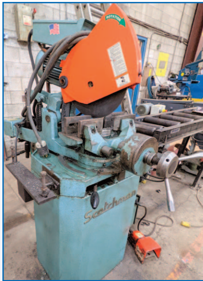
SCOTCHMAN CPO-350 COLD SAW