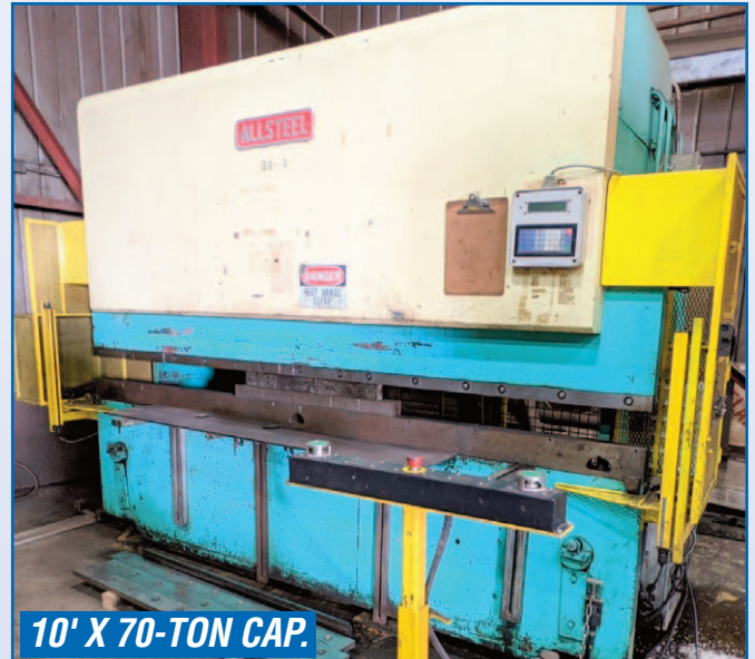
ALLSTEEL HYDRAULIC PRESS BRAKE

CLOSES: Tuesday August 24, 11:00 AM (ET)