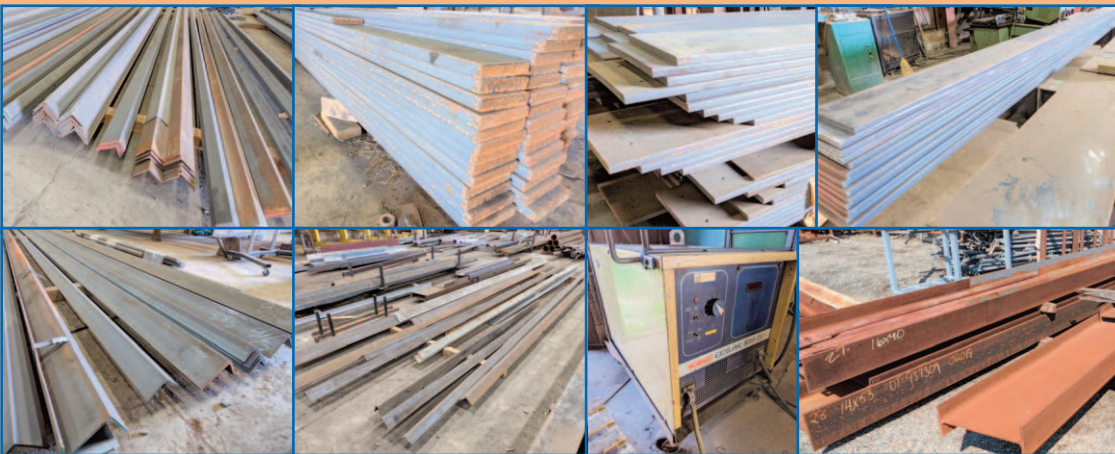
LARGE QTY. OF STEEL PLATE, ANGLE IRON, I-BEAM, SCRAP METAL

PLUS: LARGE QTY. of Steel Plate, Angle Iron, I-Beam, Scrap Steel, HILTI Power Tools, Mag Drills, Chop Saws, Welding Supplies, Welding Tables, Job Boxes, Rigging Chains, Toolboxes, Pallet Racking, Plate Lifters, Compressors, Drill Presses, Heavy Duty Storage Cabinets, Mixers, Cranes, Plant Support Equipment & Much More!